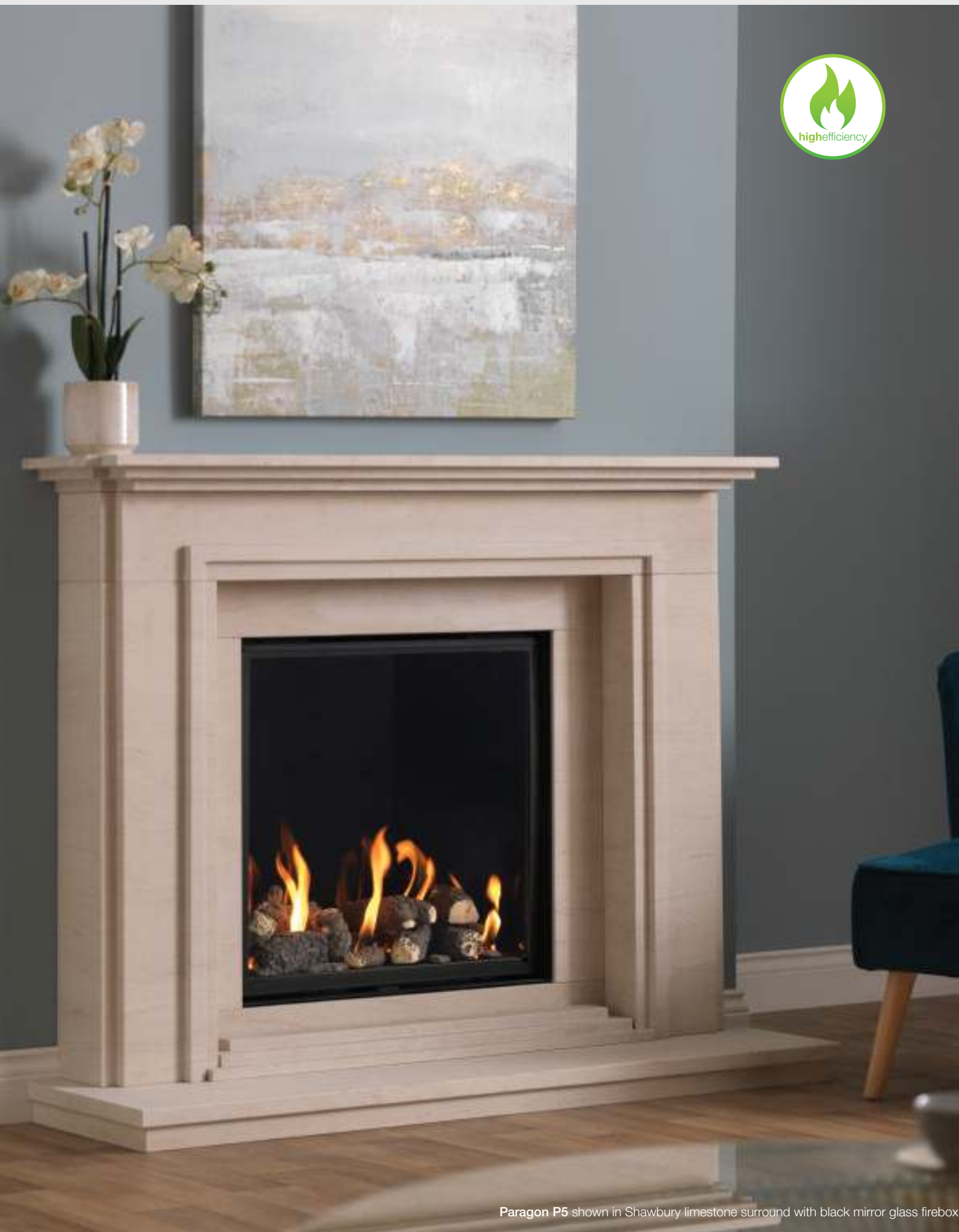
Paragon P5 shown in Shawbury limestone surround with black mirror glass firebox