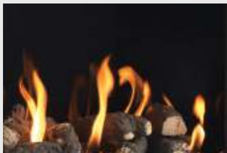
Black mirror glass firebox