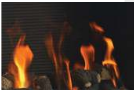
Ceramic black ribbed firebox